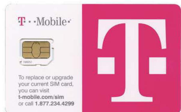
SIM card sizes